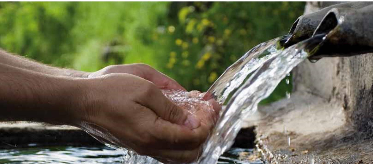
Ultrasonic water meter